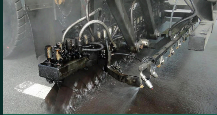
Emulcol™ breaking agent spray bar