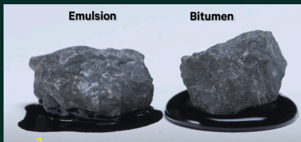
Natural 'wetting' of aggregate